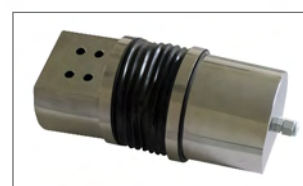
LOAD CELL PROTECTION KIT included for capacities from 60 to 300 kg